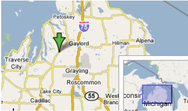
The green arrow points to Mancelona, Michigan Antrim County