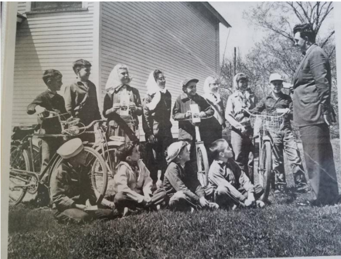
Class on Bicycle Safety 1956