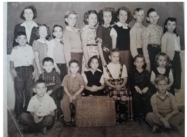
Hanchett School Class of 1949

She was a spectacular student in all subjects, especially in the subject of joke-telling.