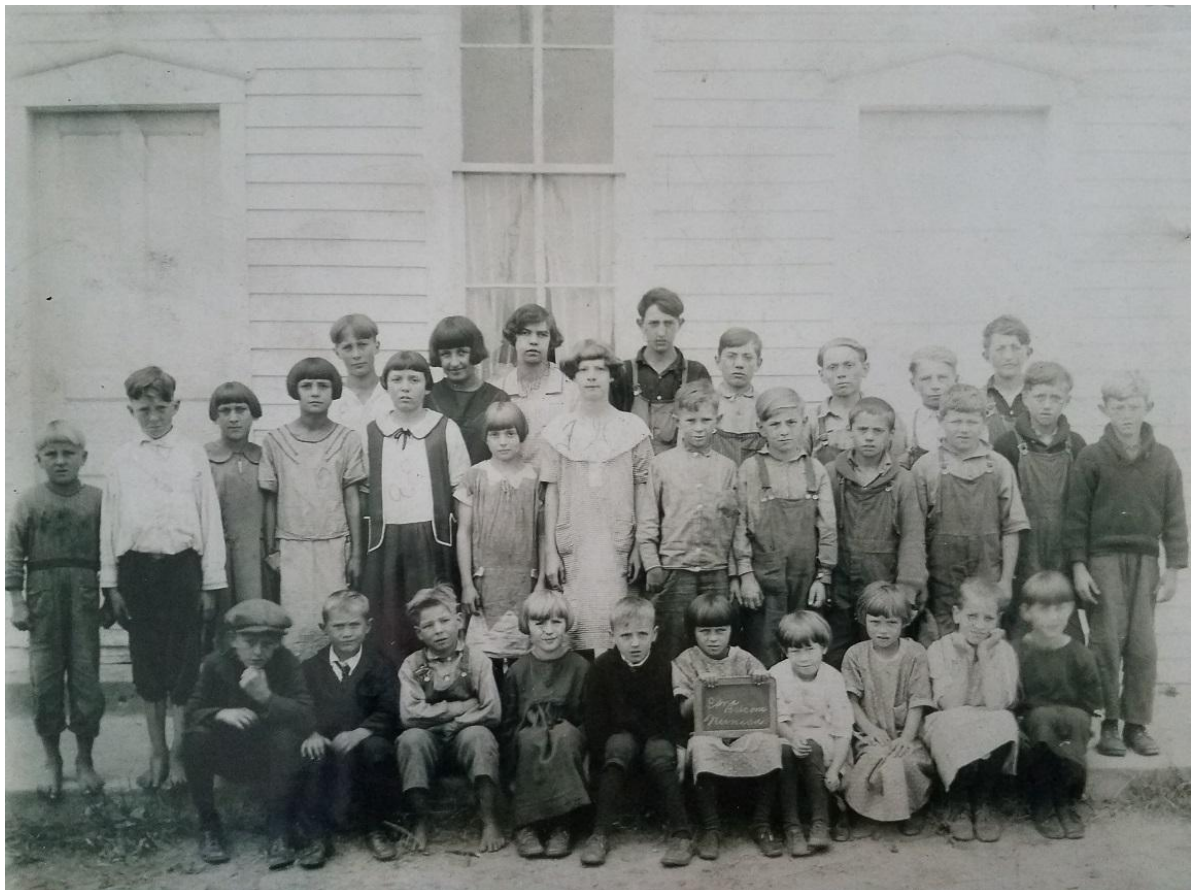
Lawrence School Students 1924