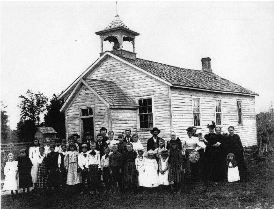
An early photo of the South Evergreen School. It currently sits on this same location on Leonard Road (formerly River Road), although it is now surrounded by trees.